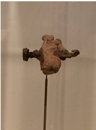
Crucifixion Nail at the Museum