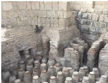
Baths at Beit Shean