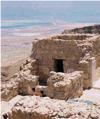
Fortress at Masada